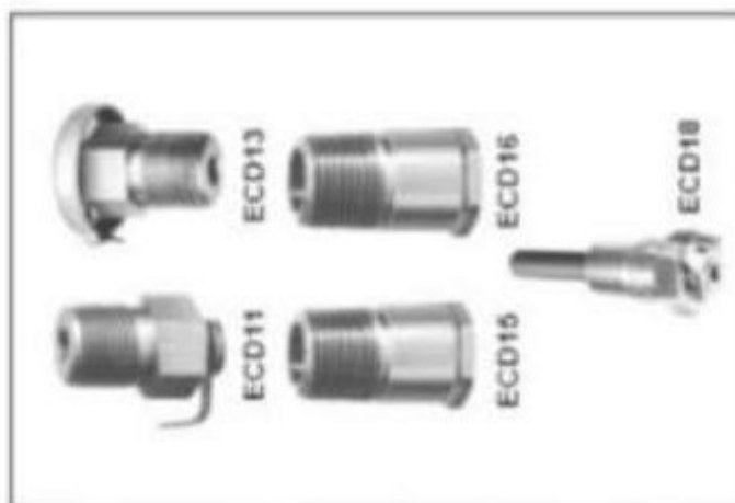
Drain Breather Accessories