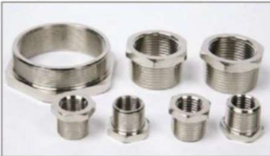
nickle brass reducer