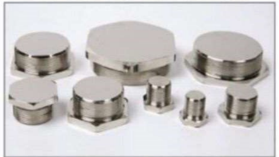
nickle brass stopping Plug