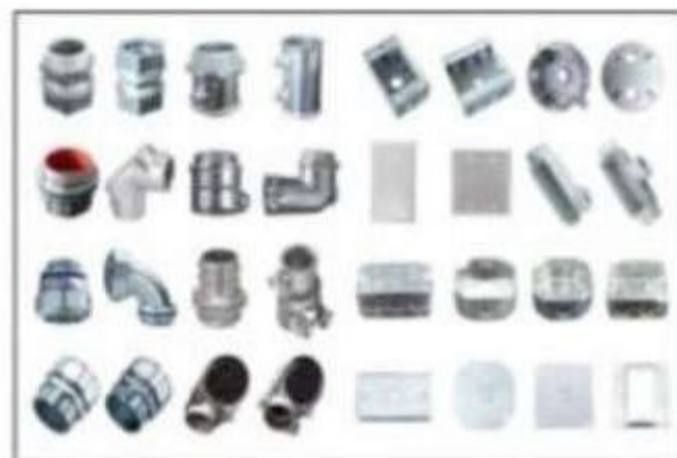
EMT Conduit body fitting