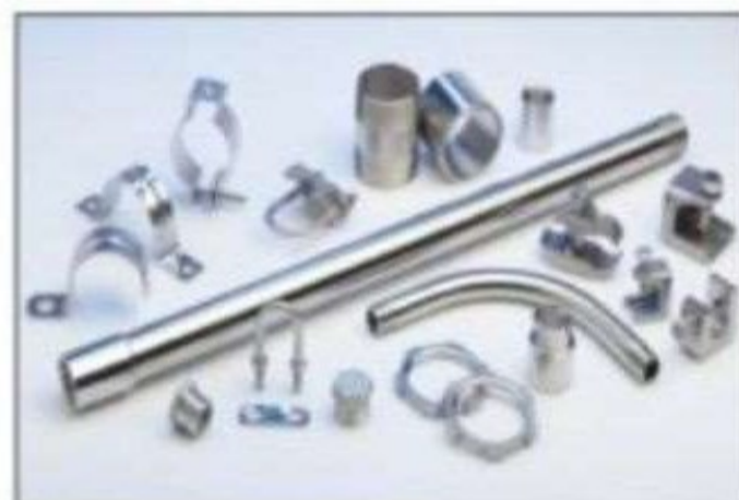
Rigid Condulet Fitting