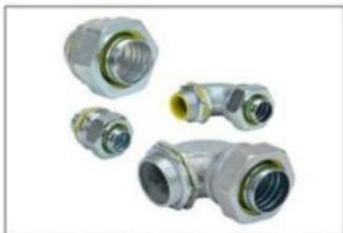
Crouse Hinds Connectors liquid-tight Straight & 90 Degree