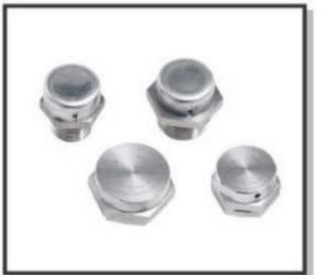
Drain breather SS