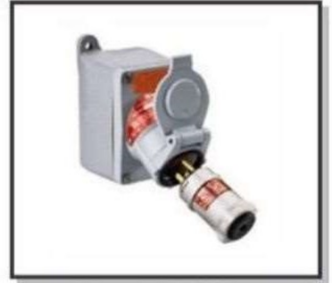
Receptical & Plug