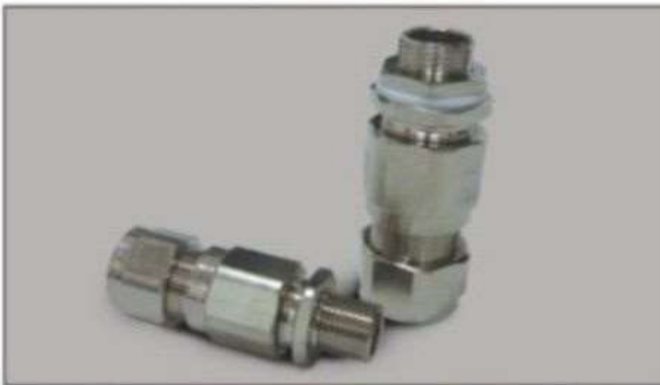
cable gland E1WF