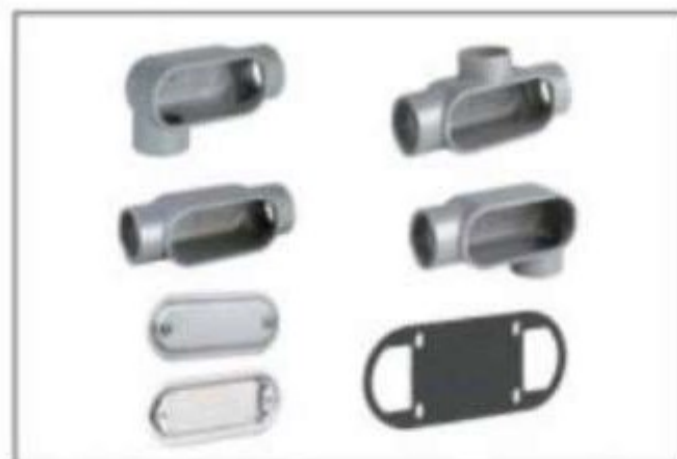
Condulet Fittings Cover & Gasket