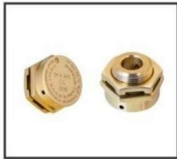
Drain breather brass