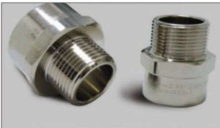
nickle brass adaptor