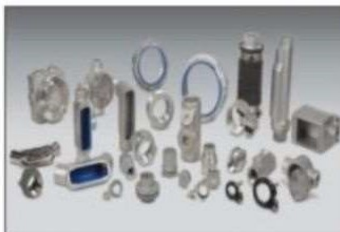
Rigid Condulet fittings