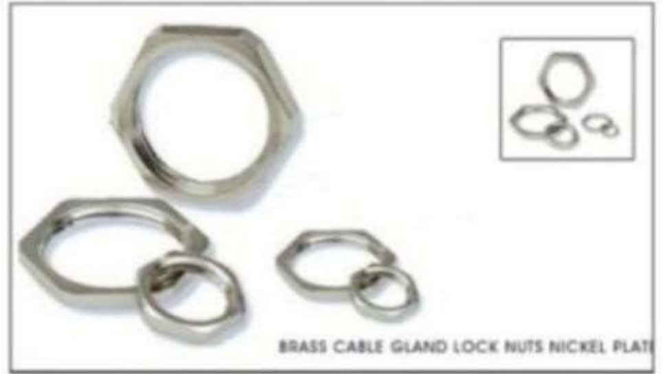
BRASS CABLE GLAND LOCK NUTS NICKEL PLATED