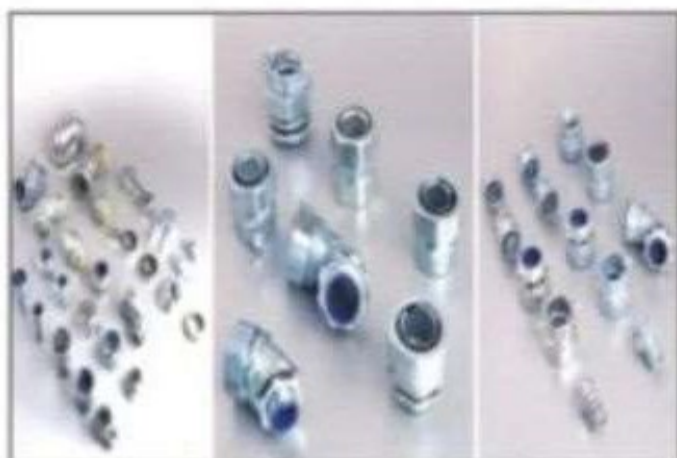
Zinc Die Cast Fittings